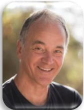
Philippe Conus Early intervention in mental health and access to quality care: an environmental, societal and political issue